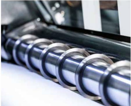
Scissor cut For best quality with long service life.