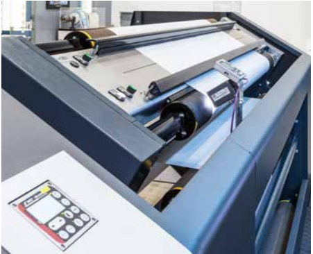
Splicing table High-quality splices made simple.